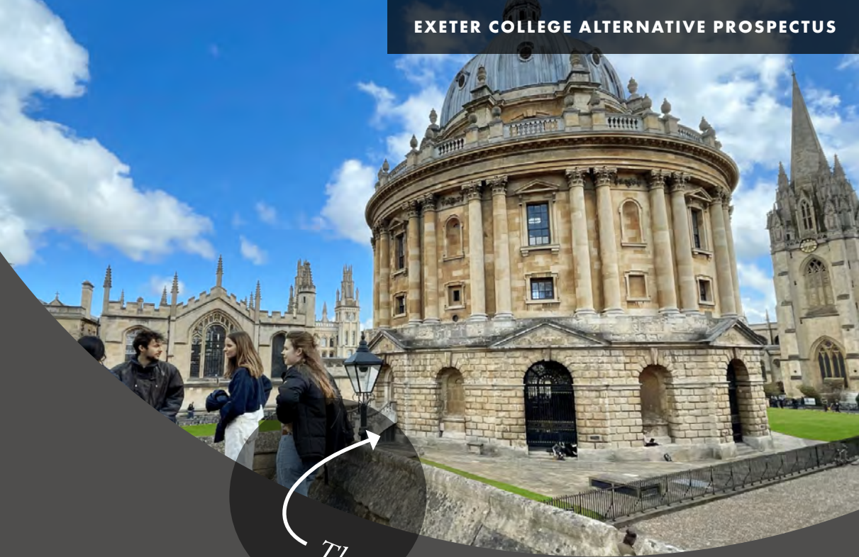
The best view in Oxford

This site also has our beautiful chapel, JCR (common room – there's always someone to challenge at Mario Kart there), stunning hall (used for both formals and normal meals) and bar. The best views are in the Fellows' Garden, which also houses our library. Older years live across a variety of locations from main site to college-owned Friendship houses (a great way to experience renting with friends without having to go through the hassle of finding places) to Exeter House and Cohen Quadrangle. Opened in 2017, Cohen Quad is Exeter's most modern site and comprises three floors of rooms as well as many conference rooms and study spaces in addition to the Dakota Café. No matter your requirements, Exeter has something for everyone and accommodation is allotted each year by a ballot to ensure as fair a process as possible.