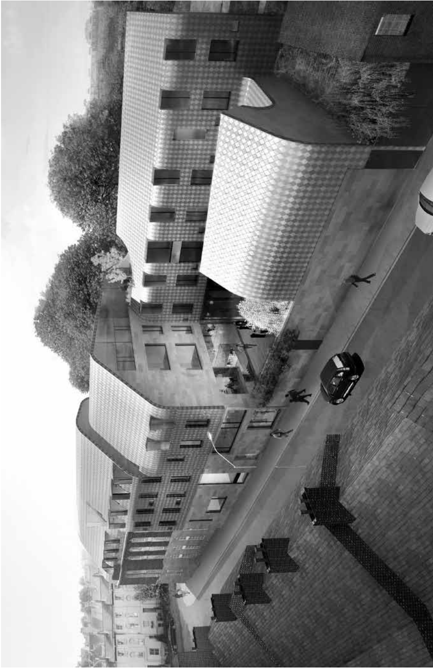
Architect's design concept of the Walton Street premises from Worcester Place, looking east